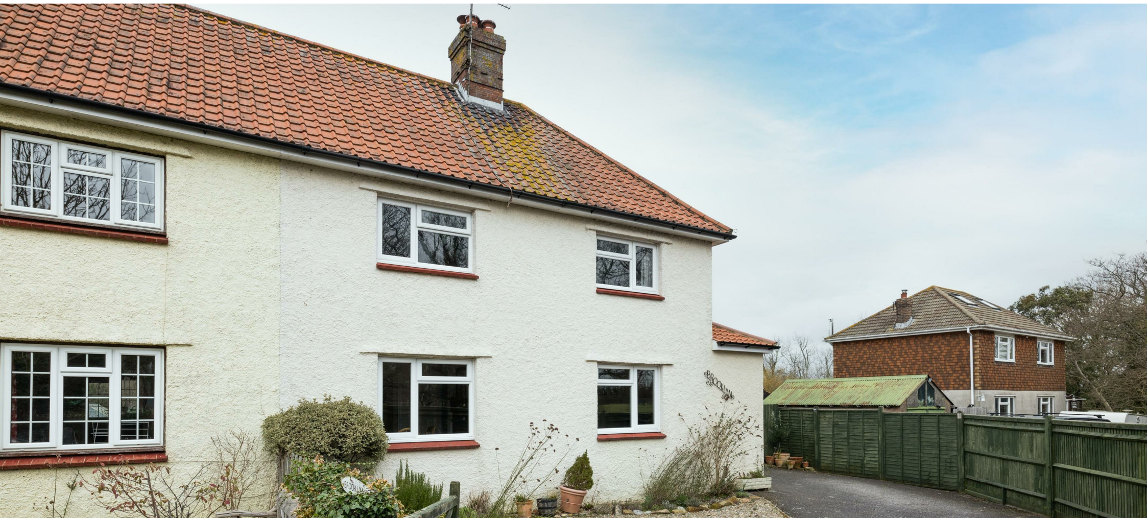
Barnfield, Plumpton Green